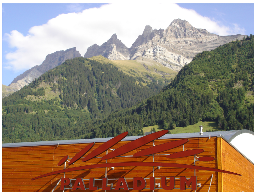
A stunning view of the Palladium with Champéry's most famous mountains: the "Dents du Midi".

The European ISU Centres of Excellence, supported by the ISU Development commission, proudly present a unique training opportunity tailored for single skaters at the Advanced Novice and Junior levels from countries currently developing their programs. Our intensive joint training camp aims to foster skill development, technique refinement, and rules understanding in the sport of figure skating.